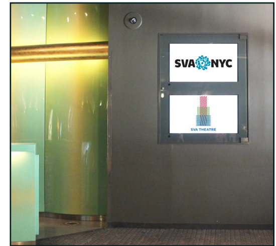
Actual image of the lobby screens