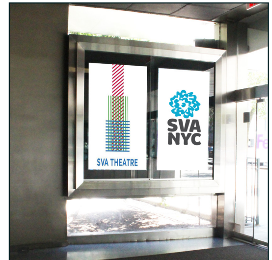
Actual image of the vestibule screens