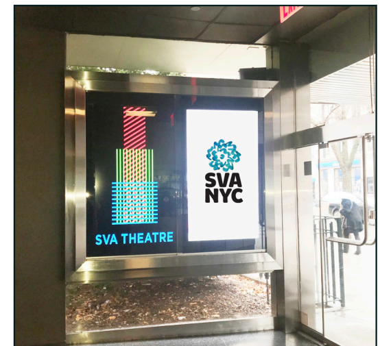
Actual image of the vestibule screens