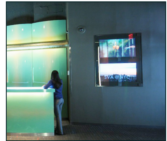
Actual image of the lobby screens